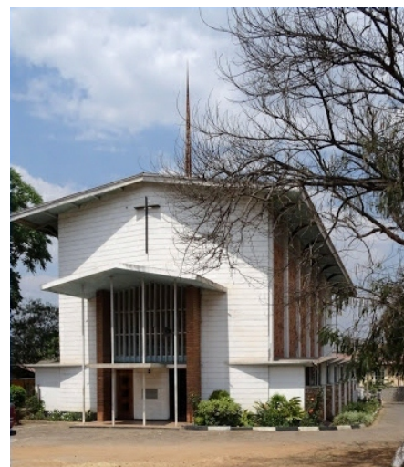
St Andrews UCZ, Ndola, Zambia

There were a couple of organs in the city, one at the Franciscan Centre and one at the United Church of Zambia (UCZ - a post-independence church based on the British free churches - that in Ndola was St Andrews and I suspect was Church of Scotland in Colonial times). Both organs were South African extension organs with detached consoles. The former hadn't worked for years but with the St Andrews one I did quite a lot of repair work, re-leathering the