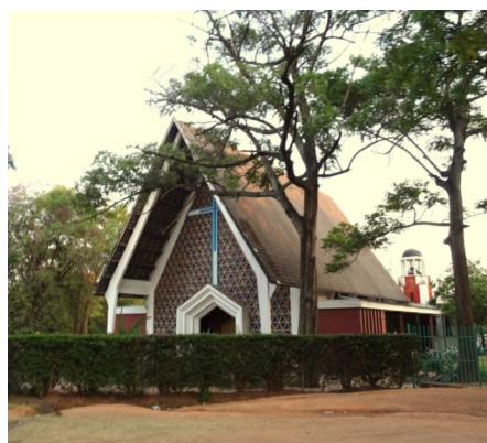
Cathedral of the Holy Nativity, Ndola, Zambia