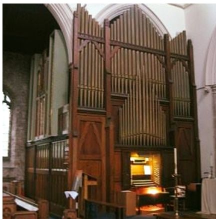
St Thomas, Radcliffe