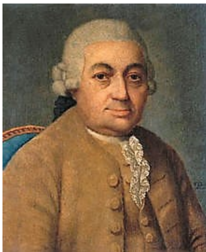
Carl Philipp Emanuel Bach (1714 – 1788)

Carl Philipp Emanuel had a great influence on the survival of Bach's legacy. He was an ardent admirer and promoter of his father's art and inherited many of his father's manuscripts. He graduated in law but gained pre-eminence as keyboard player and prolific composer (200 keyboard sonatas, concerti, symphonies, choral works, etc.) His first employment was as cembalist at the court of the flute-playing Frederick the Great of Prussia. In 1768 he succeeded Georg Philipp Telemann (his godfather – hence his second name) as Director of Music at St Michael's Church, Hamburg where he composed much church music (His Magnificat is magnificent.) He achieved lasting fame with his publication Essay on the True Art of Keyboard Playing . This weighty teaching tome, as used by Haydn, Mozart and Beethoven, is one of the most influential of its kind. His Sonata in G minor for organ is a beautiful example of the lighter compositional style that he evolved, still retaining clear traces of his father's contrapuntal skill.