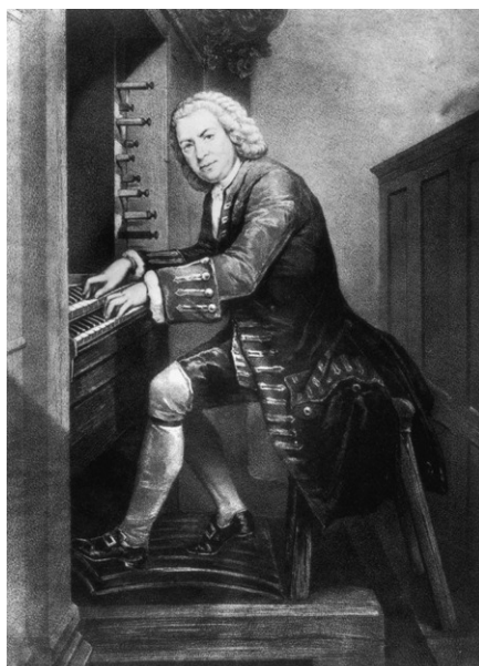
The performer: Johann Sebastian Bach

Changing Musical Taste: After Bach's death, his music soon went out of fashion. It was considered complicated and serious. Counterpoint was the hallmark of his compositional style, but a simpler 'galant' style became popular towards the end