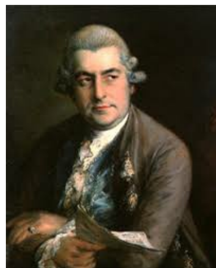
Johann Christian Bach (1735 – 1782)

For me these examples help to appreciate the changes in popular taste when one reads that Sebastian Bach's music was considered "out of fashion".