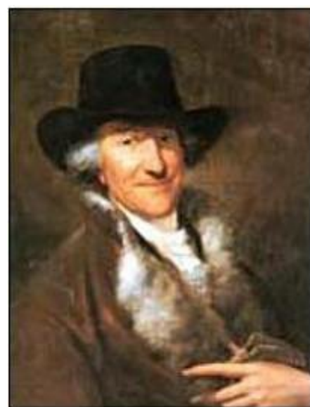
Wilhelm Friedemann Bach (1710 – 1784)

There is no doubt that Friedemann acquired a reputation as a renowned organist, improviser and composer. He studied law and mathematics at Leipzig and Halle universities. He held organist posts at Dresden (St Sophia) and Halle (Marktkirche). Perhaps driven by his father's tutelage, his harpsichord compositions are technically very demanding. Unfortunately very few organ compositions survive, perhaps due to his chaotic later life marked by disputes and debts. In the Fugue in F one can detect his father's contrapuntal style more strongly than in music of the other sons.