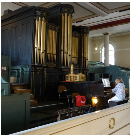
St Philip's, Salford