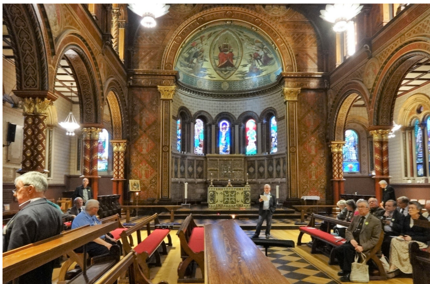
King's College Chapel, London