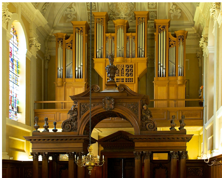
The Queen's College - Organ by Frobenius 1965

If that goes well then perhaps we could work with other adult groups. Any suggestions to the Editor please.