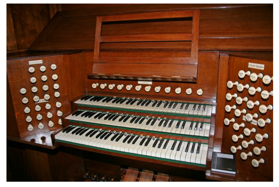
Above: The Kelvingrove organ console. Below: Console detail showing the combination buttons.

Two other things any recitalist has to be aware of: the first is the tradition that every concert starts with a piece based on the hymn tune Kelvingrove , naturally, and because there are very few of these published, you have to become a composer. This I did, the outcome being Three Kelvingroovy Variations . The first is a pastiche of