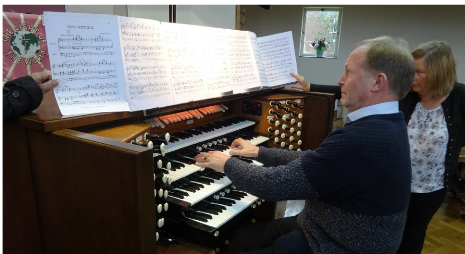
Look - no page turns! Our Chairman shows how it is done.