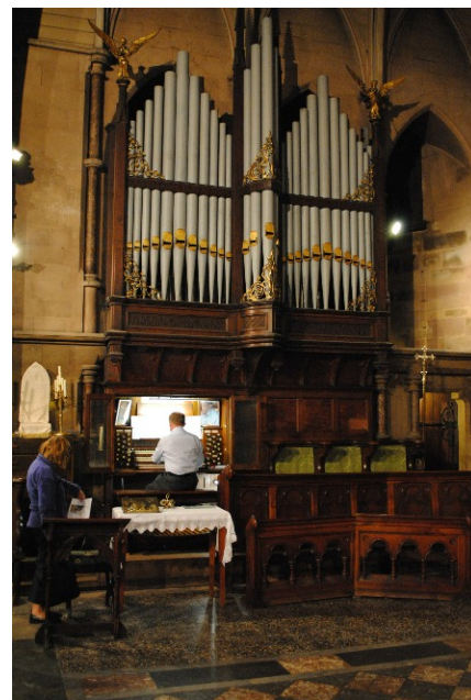
The Abbott at St Luke's