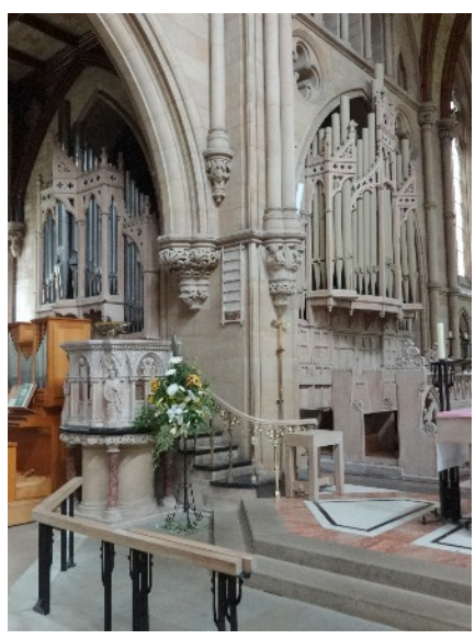
St John's, Ranmoor. North chancel cases.