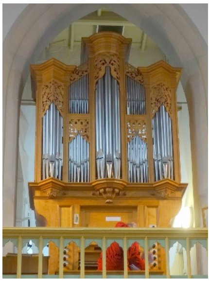
St Matthew's Carver Street. West gallery.

frequently confused us in trying to remember which manual was currently active for those stops. The tone generally was very bright, fulfilling its Baroque promise, but would need skilled handling for later repertoire.