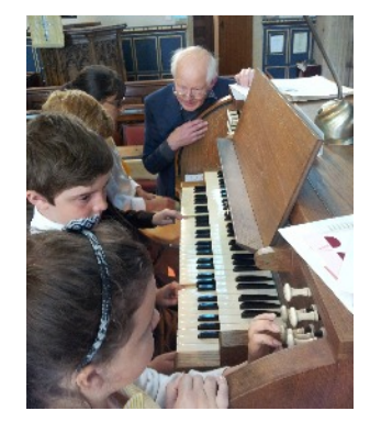
Pupils explore the console

are reproduced by kind permission of the Old Vicarage School. One group went to the Walter Evans Room to investigate a specially designed mini-organ, with three stops and an octave of notes, where you can see the mechanism - the children took it in turns to operate the hand-pump and play the keys. Meanwhile another aroup in the link-corridor experimented with a pedal-board, with a lower bench for short leas. A third group was treated to a slide show in the chancel about organs, while a fourth in the crossaisle had a go at designing the layout of pipes in an organ case and decorating the pipes. Finally, they could try the actual church organ itself, under careful supervision!