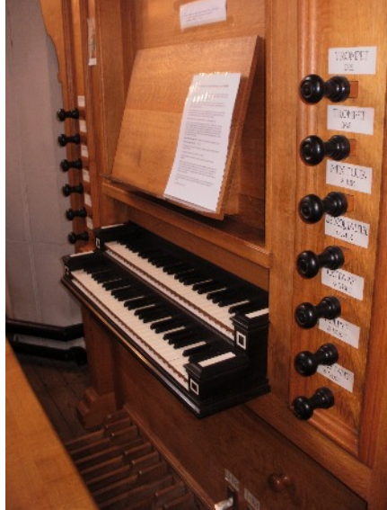
St Matthew's. Purely mechanical console.

The splendid sight of the organ in the western gallery at St Matthew's immediately promised Baroque tones and members lost no time in testing it with Pachelbel, Bach and Buxtehude. The mechanical action of the manual had a very light and responsive touch, the sort that offers great scope for expressive phrasing and ornamentation but which also demands precise fingering. All the registers were unenclosed and, with door-knob style stops having about four inches of drawing action, some of us were required to practise our skills as registration assistants to achieve suitably quick registration changes. For three of the stops, the drawstop had a curious feature, such that when pulled out to its halfway point, the stop was playable on one manual, but when pulled all the way, it was playable on the other manual. This seemed very clever, but