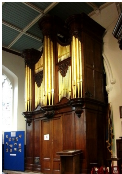
St Peter's: North aisle case c.1770

solution was considered and implemented; much of the pipework would be discarded and a hybrid instrument constructed combining the use of pipework with digitally sampled sound. The new three-manual instrument was formally dedicated in February 2011. It has two facades; the Georgian case facing the north aisle and a second case facing the choir in the chancel.