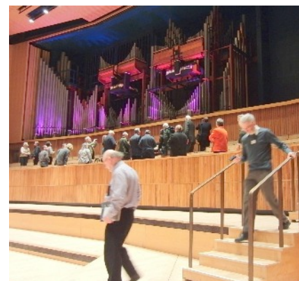
Tea-time - Time for a close inspection