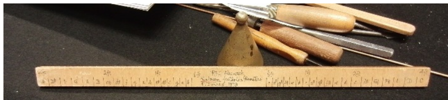
The ruler of Ralph Downes, specifying the minimum diameters for pipe footholes