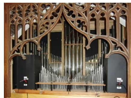
St Peter's: Interior view of the Choir organ