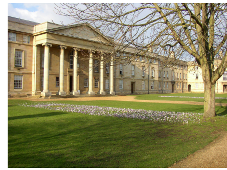
Downing College, Cambridge

"The Academy students were encouraged to attend conducting lessons with Patrick Russill and we took it in turns to conduct — much more productive than conducting someone playing the piano!